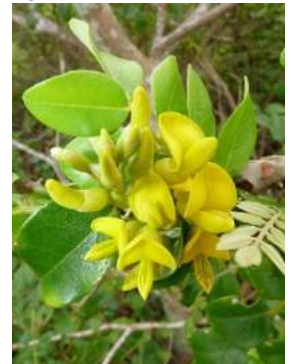
30 Sophora tomentosa FABACEAE