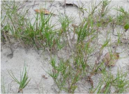
25 Paspalum vaginatum POACEAE

[ http://fieldguides.fieldmuseum.org ] [682] version 3 06/2015