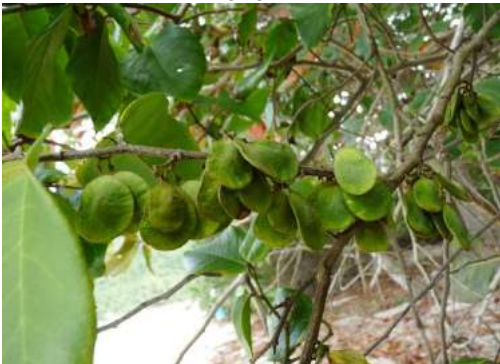
28 Dalbergia ecastaphyllum FABACEAE