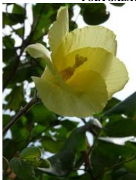
22 Talipariti pernambucense MALVACEAE