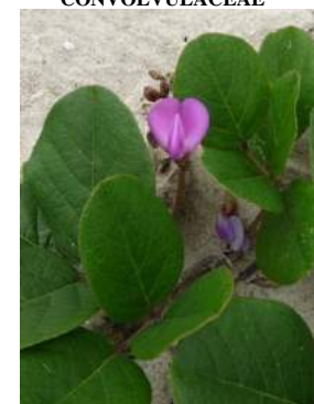
18 Canavalia rosea FABACEAE