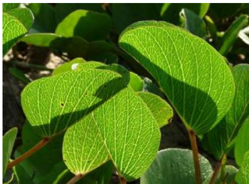
14 Ipomoea pes-caprae CONVOLVULACEAE