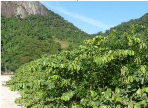
31 Sophora tomentosa FABACEAE