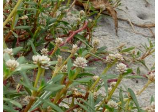
3 Blutaparon portulacoides AMARANTHACEAE