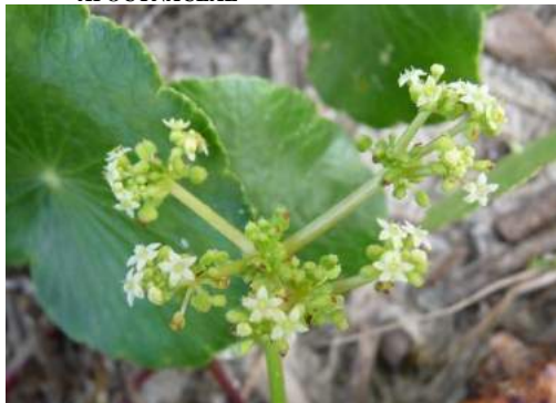
8 Hydrocotyle bonariensis ARALIACEAE