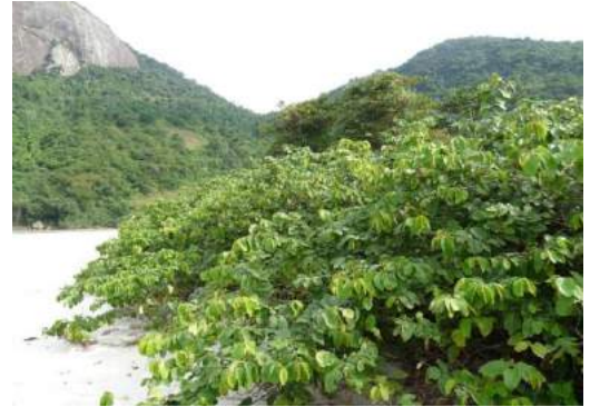
27 Dalbergia ecastaphyllum FABACEAE