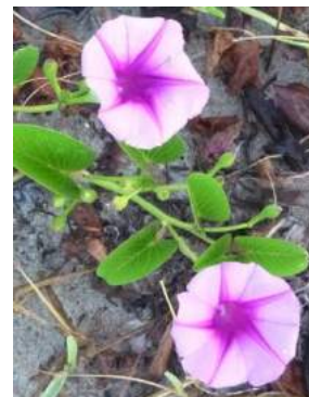
15 Ipomoea pes-caprae CONVOLVULACEAE