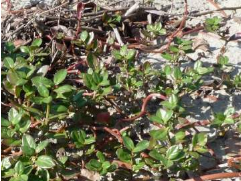
1 Alternanthera littoralis var. maritima AMARANTHACEAE

[http://fieldguides.fieldmuseum.org] [682] version 3 06/2015