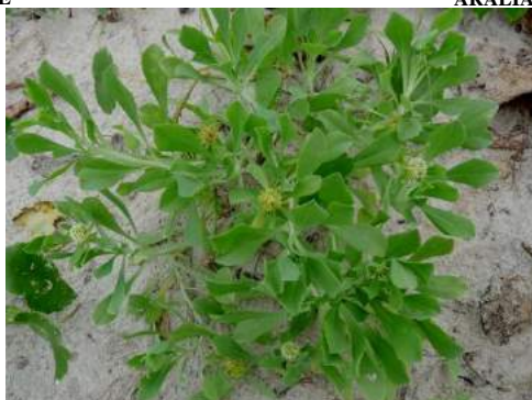
11 Acicarpa spathulata CALYCERACEAE