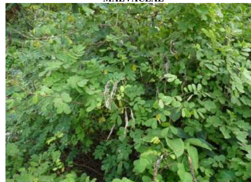
24 Senna pendula FABACEAE