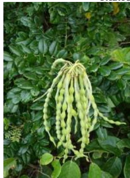
32 Sophora tomentosa FABACEAE