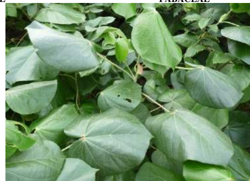
21 Talipariti pernambucense MALVACEAE