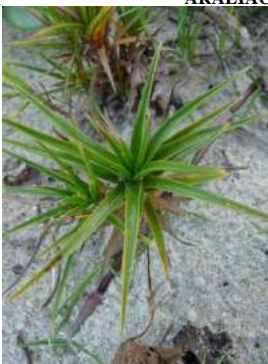
10 Remirea maritima CYPERACEAE