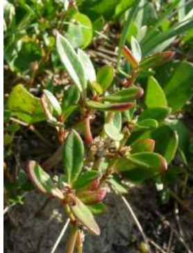
2 A. littoralis var. maritima AMARANTHACEAE