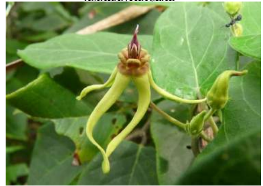
6 Oxypetalum banksii APOCYNACEAE