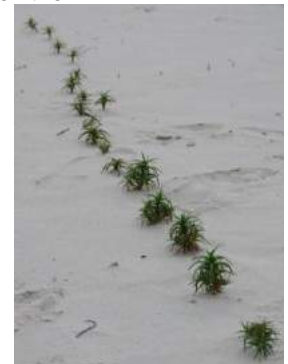
9 Remirea maritima CYPERACEAE