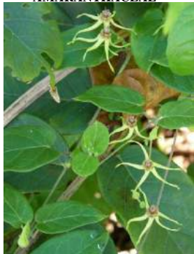
5 Oxypetalum banksii APOCYNACEAE