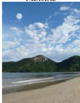
35 General View of Dois Rios Beach