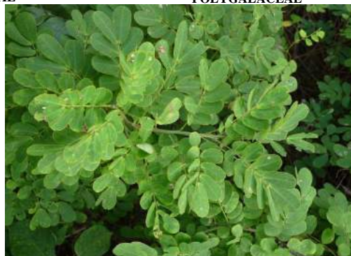
23 Senna pendula FABACEAE