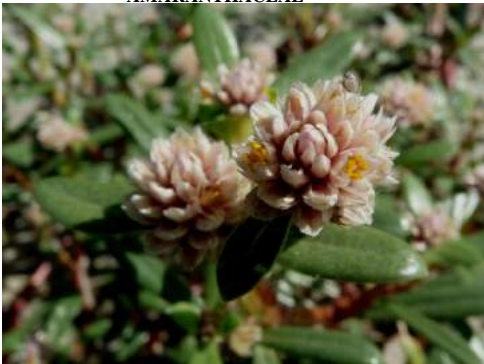
4 Blutaparon portulacoides AMARANTHACEAE