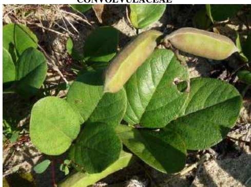
16 Canavalia rosea FABACEAE