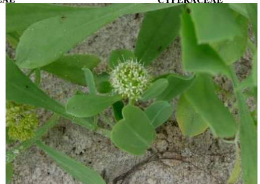
12 Acicarpa spathulata CALYCERACEAE