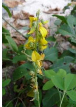
26 Crotalaria pallida FABACEAE