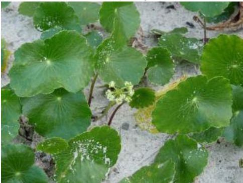
7 Hydrocotyle bonariensis ARALIACEAE