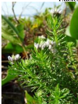
20 Polygala cypris POLYGALACEAE