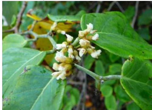
29 Dalbergia ecastaphyllum FABACEAE