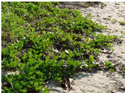
13 Ipomoea pes-caprae CONVOLVULACEAE

[http://fieldguides.fieldmuseum.org] [682] version 3 06/2015