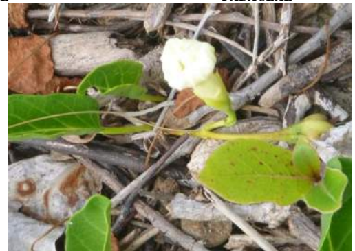
33 Ipomoea imperati CONVOLVULACEAE