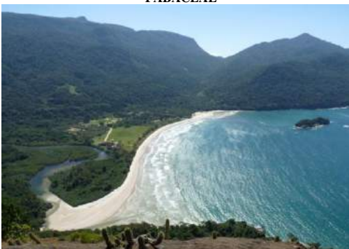
34 General View of Dois Rios Cove