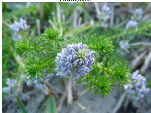
19 Polygala cypris POLYGALACEAE